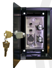
MX120A with OPT 01 Surface Mount Vandal Case