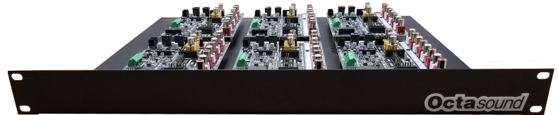
RS6 with 6 RASX4 Main Boards

Rack panel shall be KDM part # RS6 . The panel shall be fabricated from 16 guage steel and have a black powder epoxy finish. The rack unit shall be 19W x 1.75"H x 16"D. The rack unit shall provide for up to 6 single gang devices.